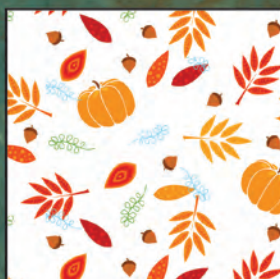
Fall Pattern Item#XCW40FP

Cel-U-Wrap (40 inches wide x 100 feet long packed per roll)