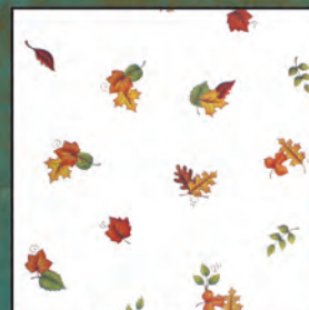
Autumn Leaves Item#XCW40AUT