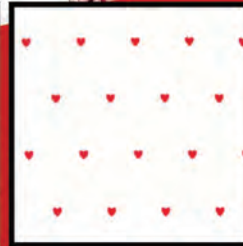
Red Hearts 1 lb. OPP Bag Item#HEARTBG-1