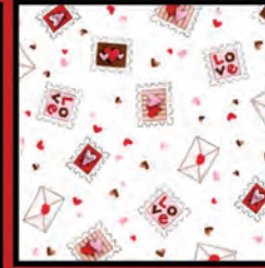
Stamps Cel-U-Wrap Item#XCW40STAP